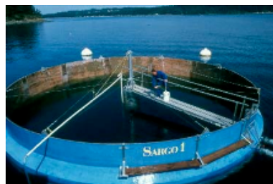
Floating fiberglass closed tank from US company, Mariculture Systems Inc.

In BC, commercial scale trials are in the implementation stage and once up and running will demonstrate economic viability, cost-benefit comparisons to open net-cages and environmental performance. Cost-benefit comparisons explicitly assess externalities, costs currently borne by society or the environment and not by salmon producers, to inform discussions of financial viability. In Normandy, France a land-based recirculation system has already been approved, received start-up funding and plans to start construction shortly.